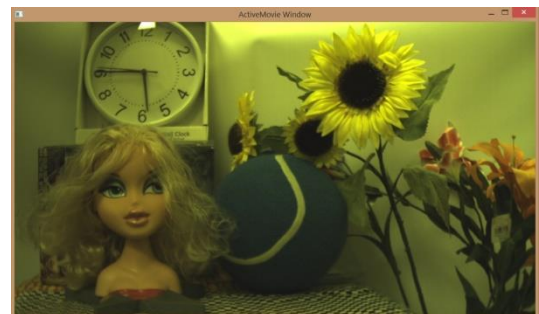
Camera Tool view mode