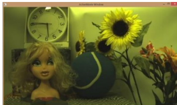
Camera Tool view mode